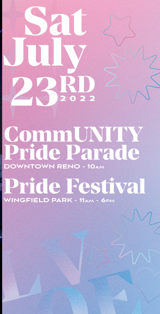
Northern Nevada Pride Parade Event Marketing