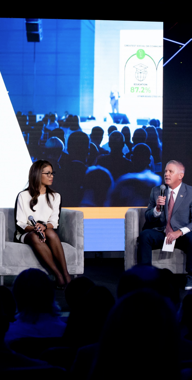
Moonridge Foundation Philanthropy Leaders Summit