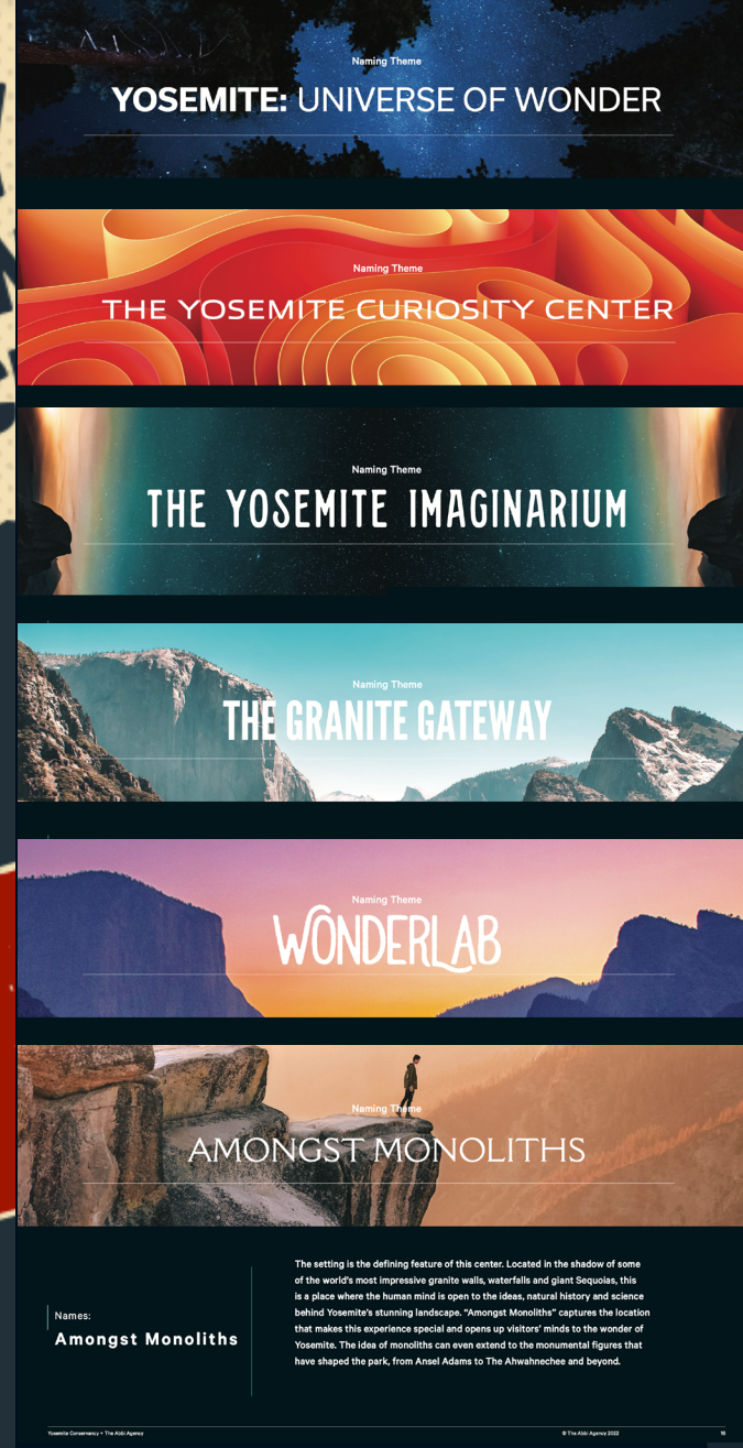
Yosemite National Park Visitor Center Naming