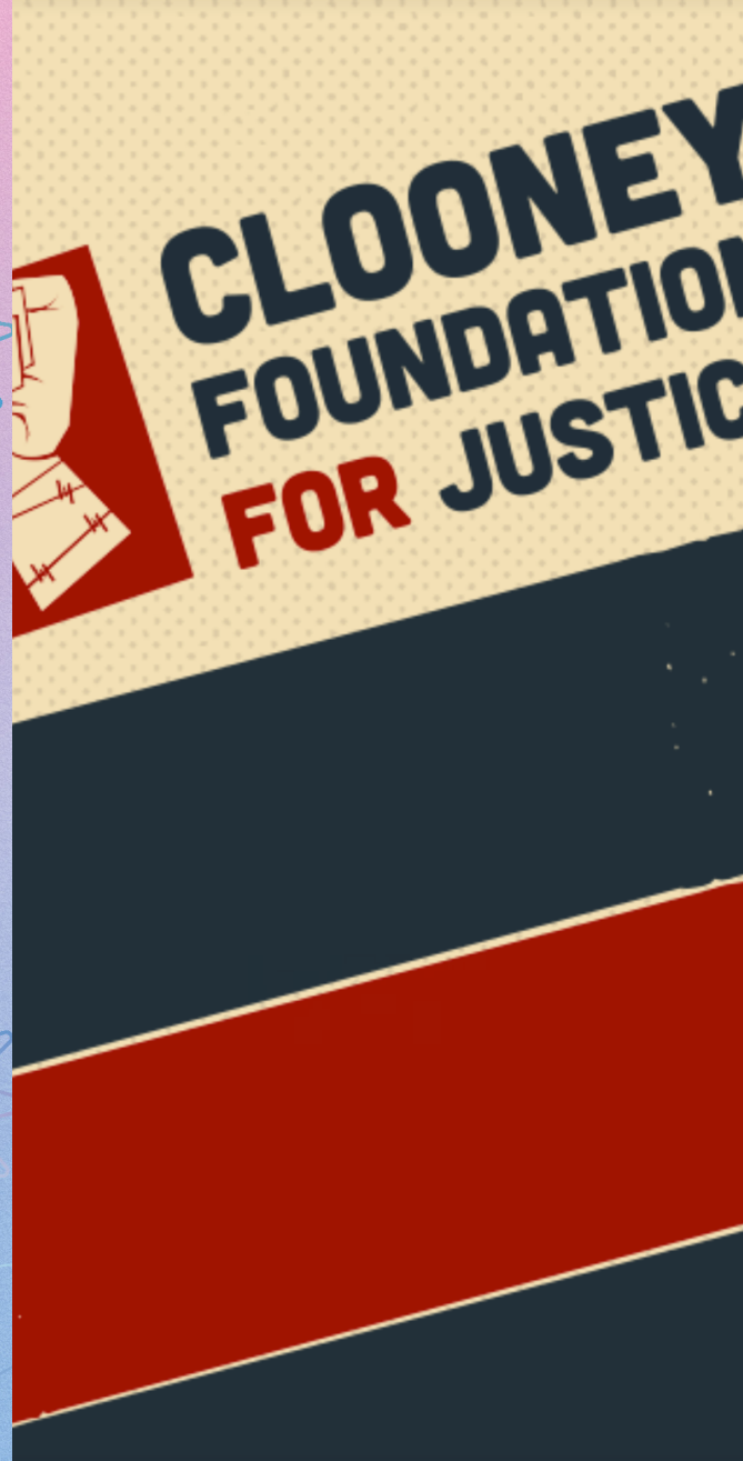
Justice for Survivors Award nomination and award announcement public relations